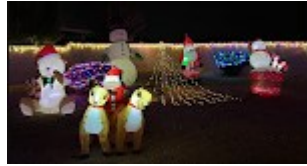
2nd Place: 5597 Spur Heel