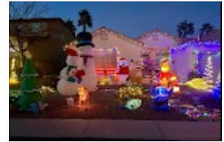
3rd Place: 9894 Shadymill