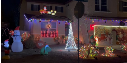
1st Place: 10019 Twilight Mist

Congratulations to the contest winners and thank you to the participants! More photos can be seen via the Map link at shadowmountainranchhoa.com